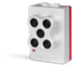
MicaSense RedEdge-MX Industry-leading