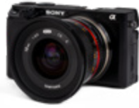
Oblique Sony a6100 3D mapping camera